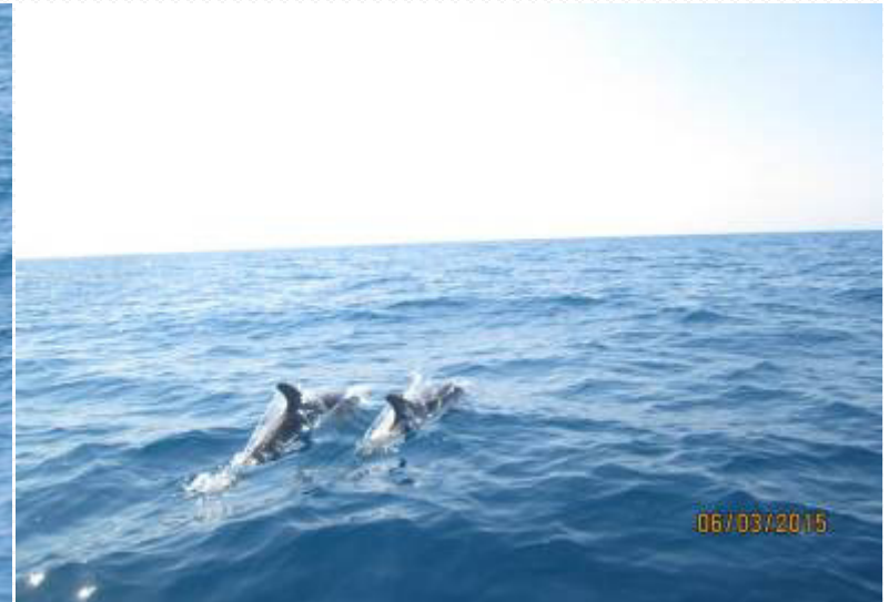
Stenella coeruleoalba (June 2015)