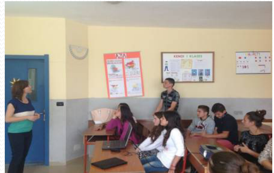
Photos from the lessons at Velipoja School, Shkoder