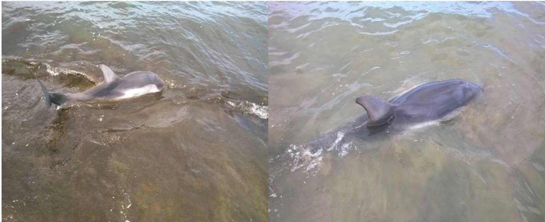
Divjake, May 2015

Strandings during NETCET period - Tursiops truncatus : 4 dead records, 1 stranded alive and released in June 2015- Stenella coeruleoalba : 2 dead records