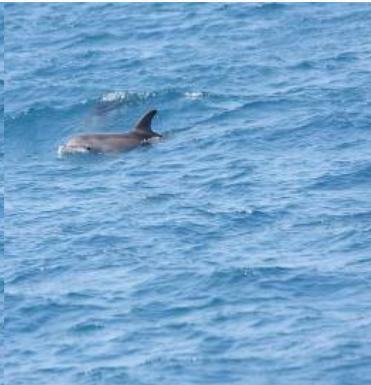
Tursiops truncatus (October 2013)