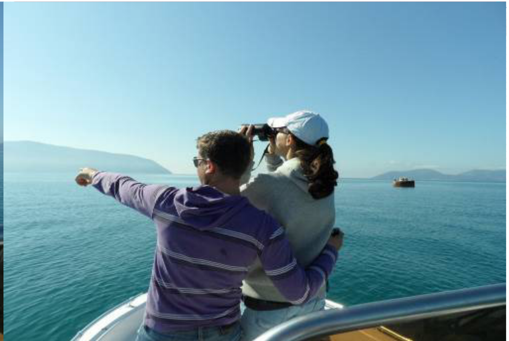
During the survey in October 2013 in Vlora Bay