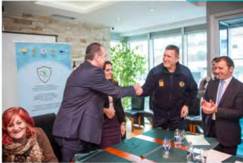
MEMORANDUM SIGNED BETWEEN PARTNERS