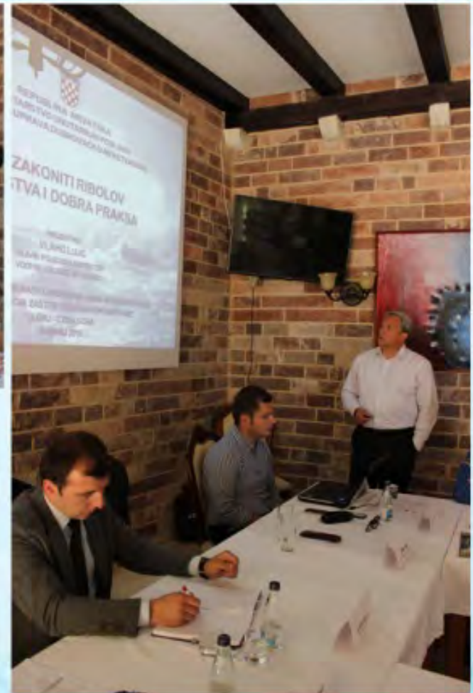
A representative from the Croatia border police shared best practice