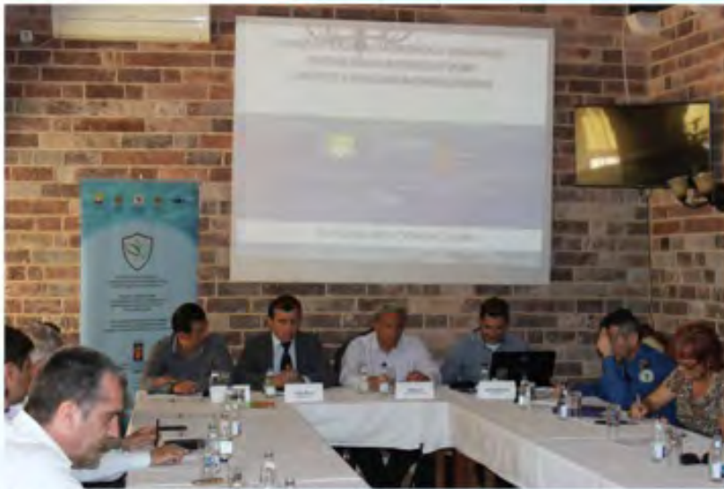
NGOs, Legal entities, Project partners